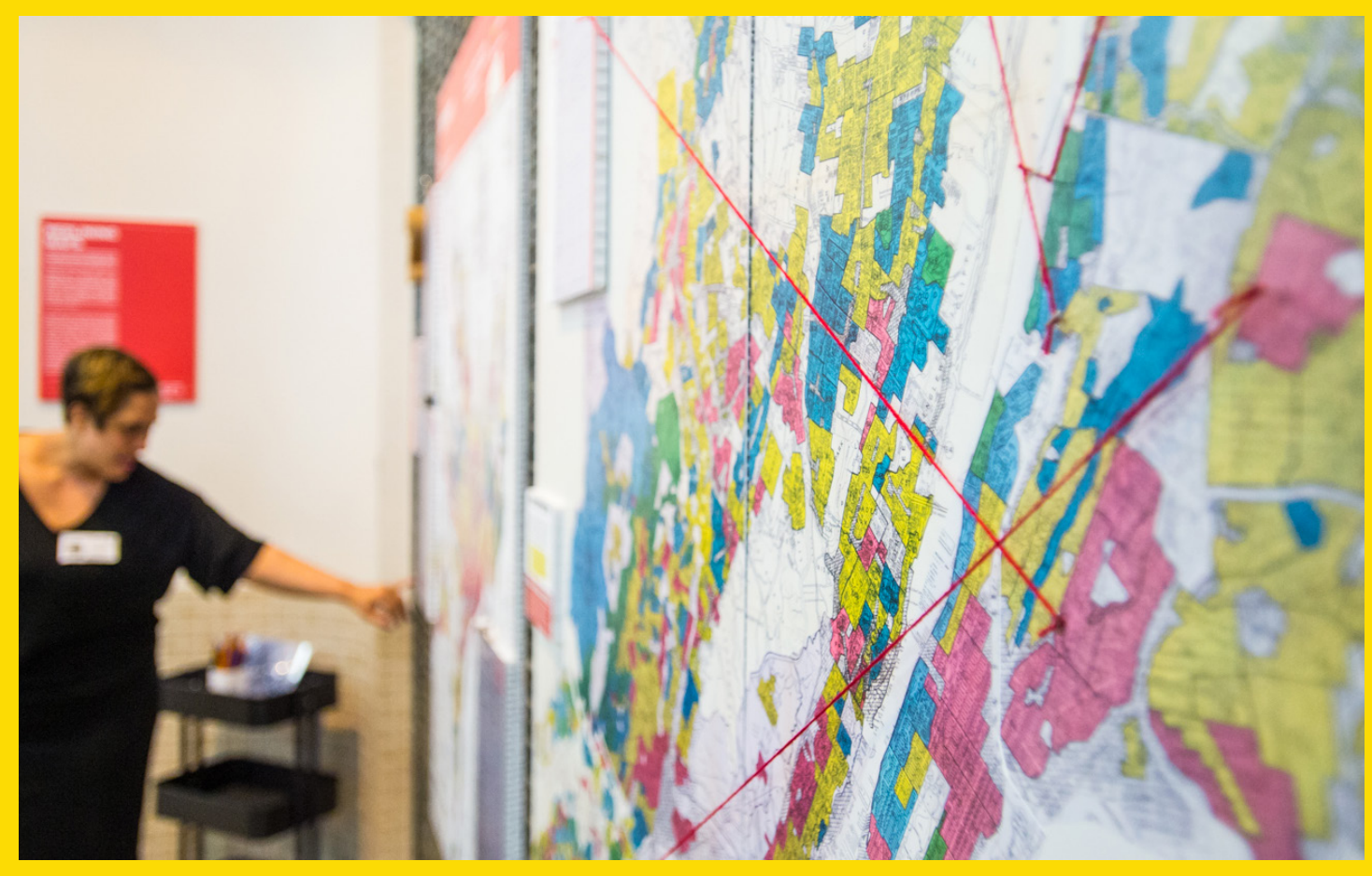
Below: (50th Anniversary of the Fair Housing Act Opening Ceremony by <u>U.S. Dept. of Housing and Urban Development</u> (<u>HUD</u>).)